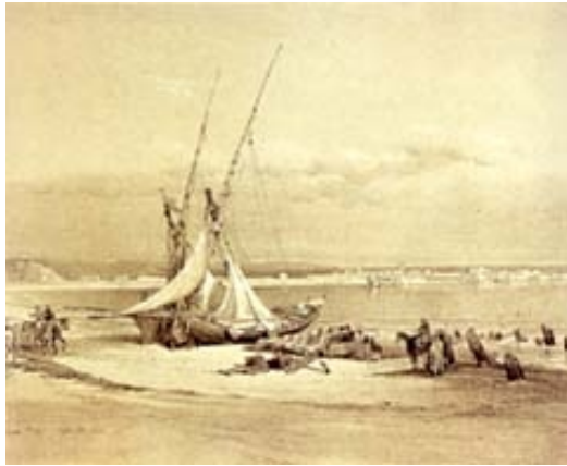
Tyre in the 1800's