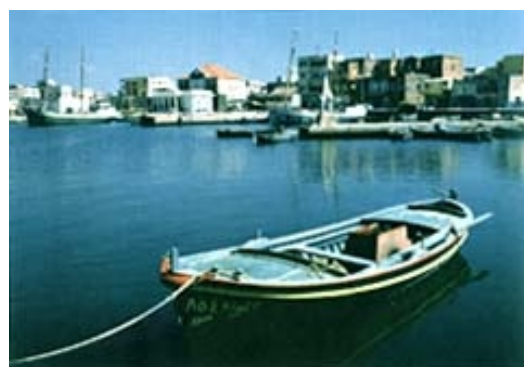
A view of the coastal city of Tyre

The archeological sites are open daily. Several seafood restaurants and pubs are located in the port area and fast food places have opened in the Hay Er-Raml area. Local restaurants fare is good. The seaside Elissa Hotel is the hotel in Tyre and is located near the hippodrome/necropolis